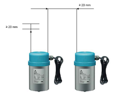
Figure 1: Minimum space over and between the capacitors.